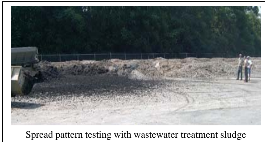
Spread pattern testing with wastewater treatment sludge

Model 1516 has a 223 cu.ft. (8.3 cu.yd.) hopper and a 15 ton capacity running gear. The 30 inch wide drag chain and the steep (53 degree) sides and UHMW plastic floor liner insure that the hopper empties completely.