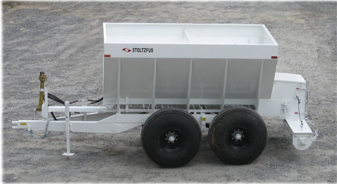
Model SSOT 80