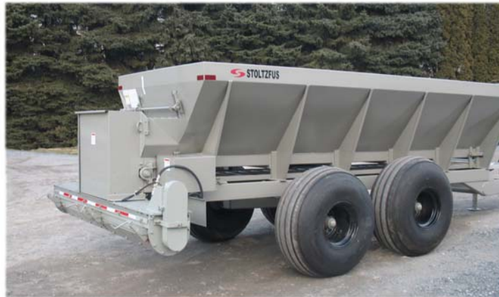
Model SSOT 1516