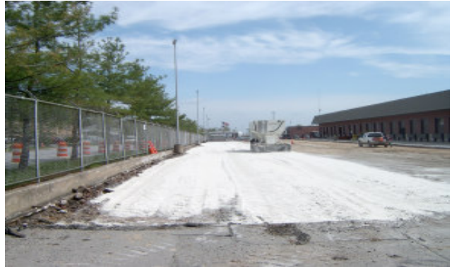
Spread in confined areas with minimum dust