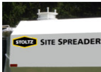
9" Pressure Relief set at 2psi.