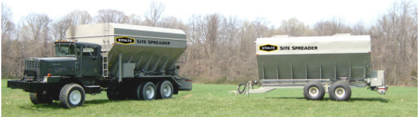
Truck-mounted or Pull-type

Hydrated, portland, flyash, quicklime or bentonite