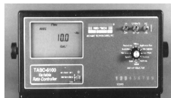
Radar controlled application rates