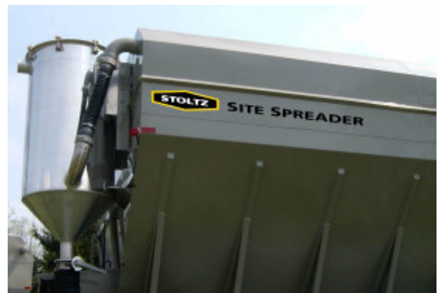
Filter can removes dust from vent air during filling.