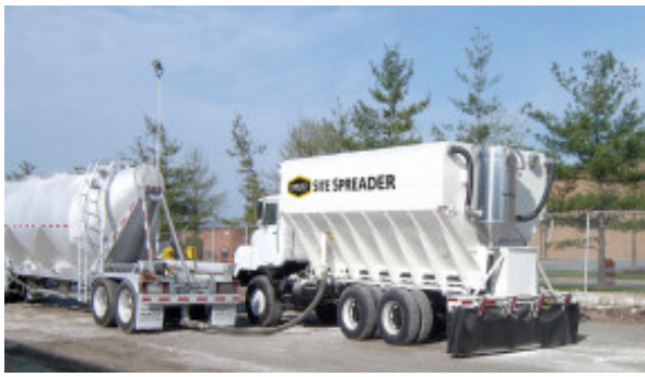
Transfer portland cement at 1 ton per minute, without dust.