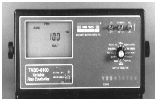
Optional radar controlled application rates.