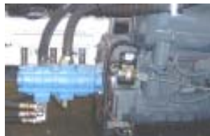
Auxiliary engine package for extremely high rates.