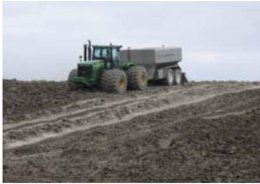
Spread in high winds with little dust.