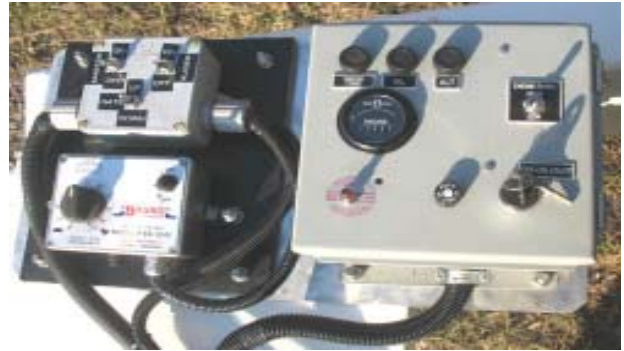
Basic rate controller and engine console for cab of tractor.