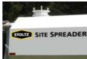
9" Pressure Relief set at 2psi - Standard.